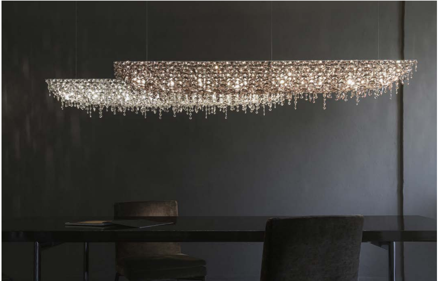
in the picture U - Line 150